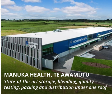
MANUKA HEALTH, TE AWAMUTU State-of-the-art storage, blending, quality testing, packing and distribution under one roof

Manuka Health are leaders in Manuka honey science. Our specialised care and expertise ensures the quality, purity and integrity of our products.